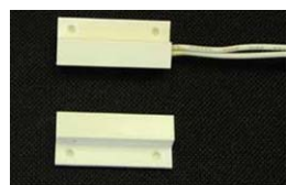
Door Contact Provides Door Position Signal