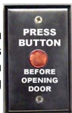
Exit Button Silences Alarm When Re-Entering