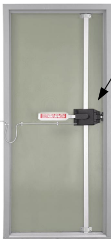
STEEL LOCK MOUNTING PLATE

How do you make the toughest exit lock even tougher? We studied attempted break-ins from coast-to-coast and came up with these product enhancements.